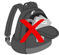
Damaged or Broken Bag