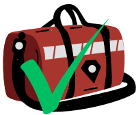
Soft duffel bag